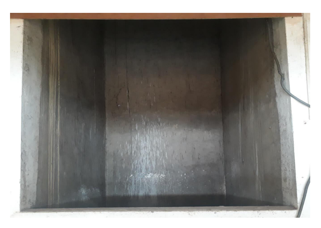
Provision for Lift